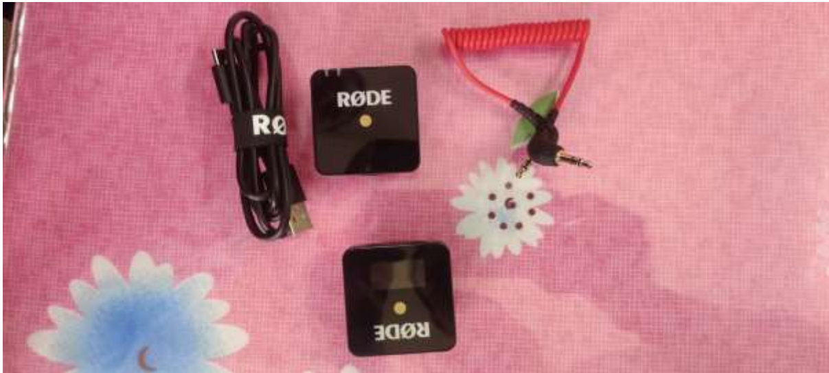
Voice Editing Equipment