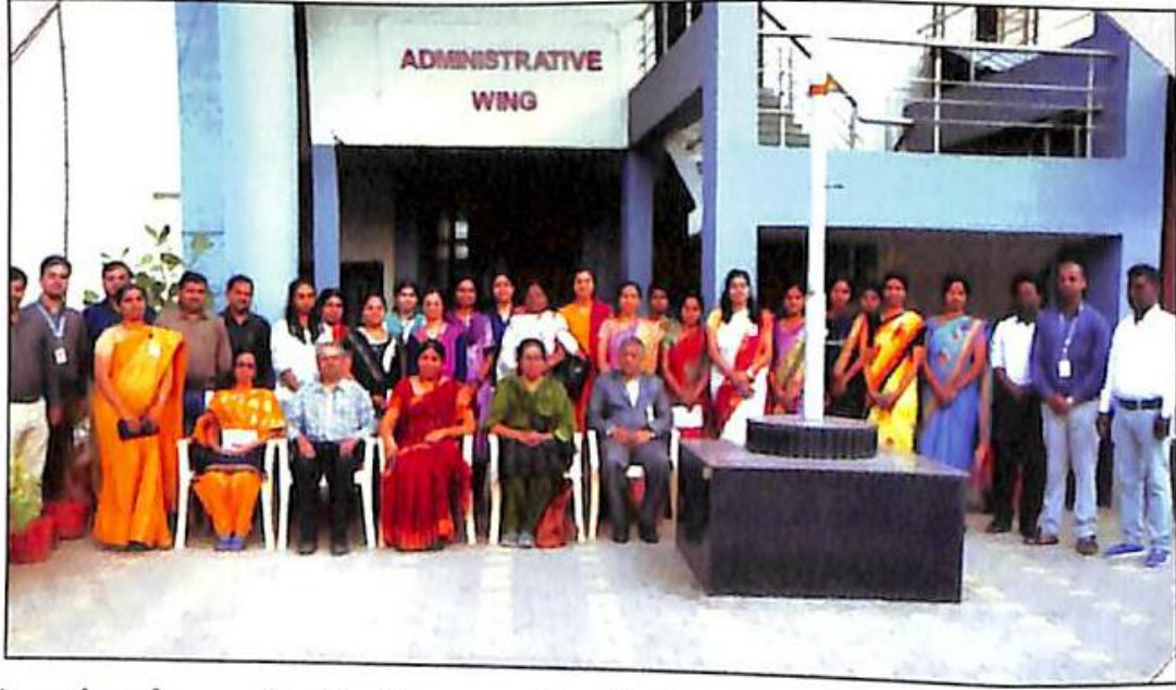
नेक संदर्भात मार्गदर्शन घेण्यासाठी मॉडर्न कॉलेज पुणे यांची टिम व या महाविद्यालयातील प्राचार्या व सेवक