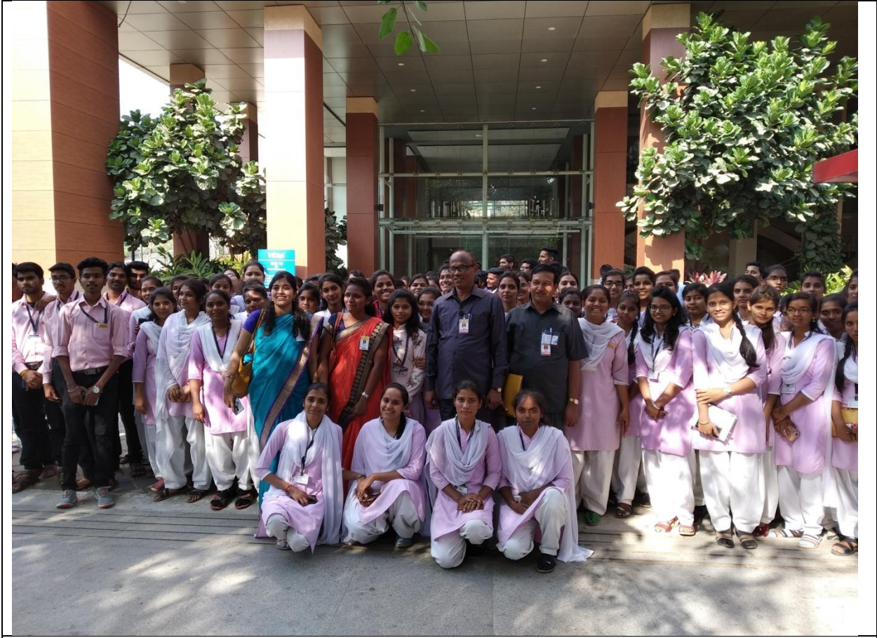
Industrial Visit to Infosys Company Pune on 19 th January 2019