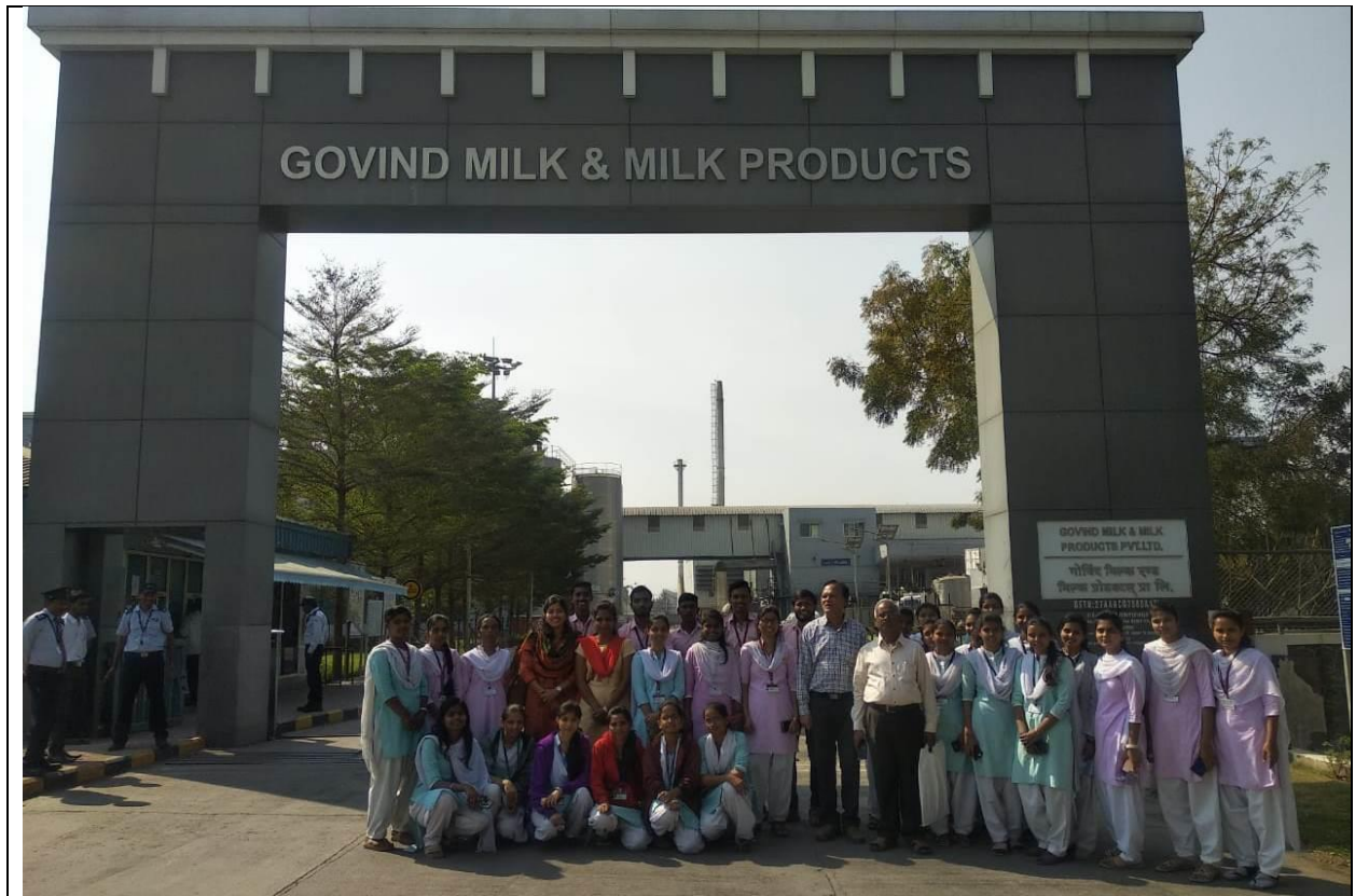
Visit to Govind Milk and Milk Products, Phaltan