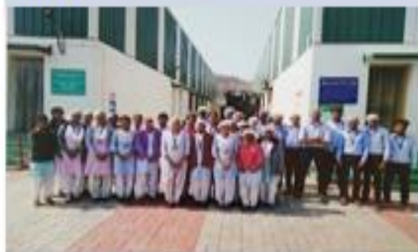
Industrial Visit to Satara Mega Food Park dated 5 th February, 2019