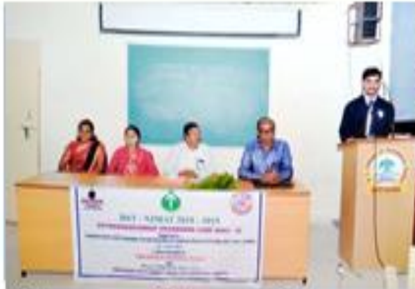
Entrepreneurship Awareness Programme dated 28 th January, 2019