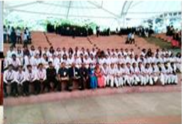
Industrial Study Tour to Infosys, Pune dated 19 th January, 2019