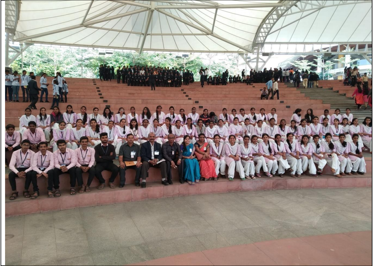
Industrial Visit to Infosys Company Pune on 19 th January 2019