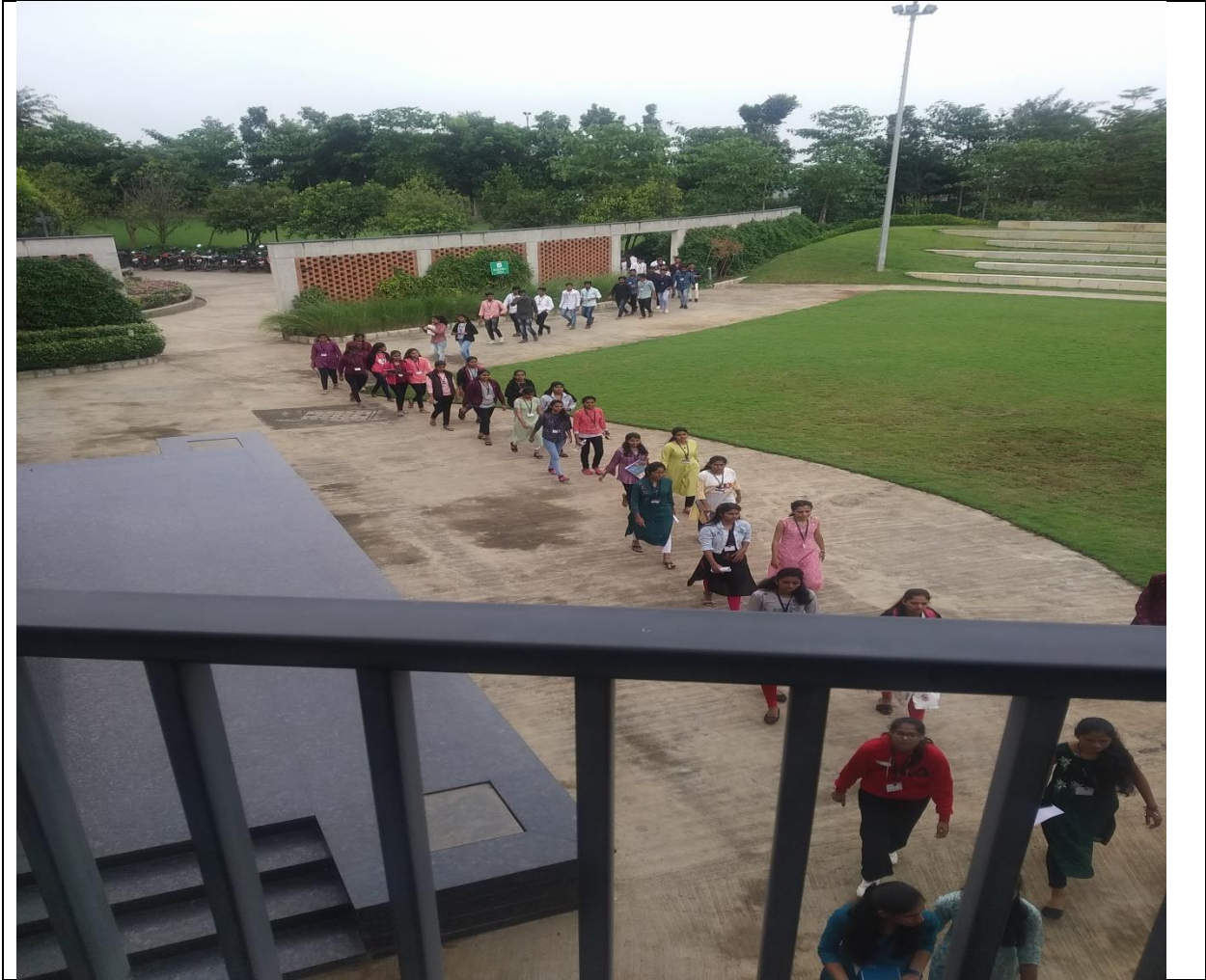
Visit to Shayadri Farm- Mohadi Nashik on 13 th October 2022