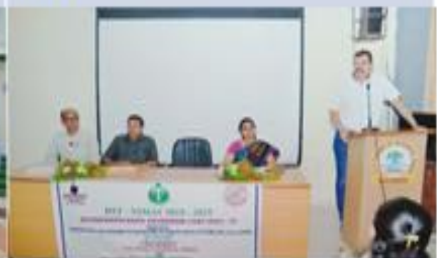
Entrepreneurship Awareness Programme dated 29 th January, 2019